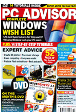
PC Advisor, issue 159 (page 96)

Removing junk files can be a tedious process, but nifty software from down under called Auslogics BoostSpeed can do it for you automatically.