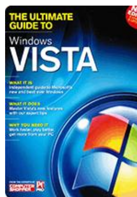
The Ultimate Guide to Windows Vista (page 73)

This application is an ideal solution for anyone who wants to boost their computer for peak performance without costly hardware upgrades.