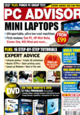
PC Advisor, issue 157 (page 58)

Auslogics BoostSpeed can protect you from identity theft. Being a computer optimization tool, it also includes useful privacy and security [tools].