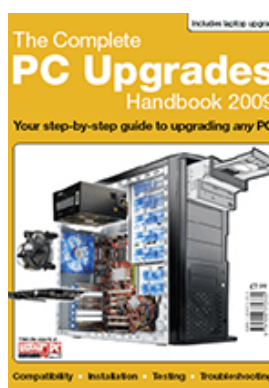
PC Upgrade Handbook (page 43)

To prevent system slowdowns from happening ... we recommend using the faster and more advanced version in Auslogics BoostSpeed.