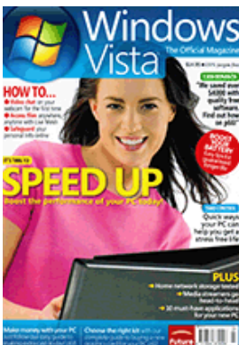
Windows Vista: The Official Magazine, issue 27 (page 6)

You can clean up, optimize and defragment your PC using Auslogics OneButton Checkup. Tests showed an impressive performance improvement.