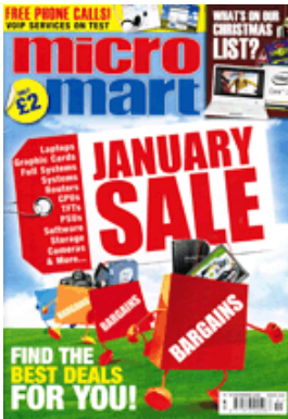
MicroMart, issue 1035 (page 56)