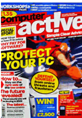
ComputerActive, issue 179

Cleaning your registry may keep your system in tip-top shape. ... This app shows how fragmented your registry is and defragments it.