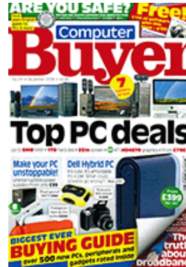
Computer Buyer, issue 211 (page 76)