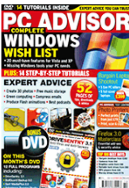
PC Advisor, issue 159 (page 96)

Removing junk files can be a tedious process, but nifty software from down under called Auslogics BoostSpeed can do it for you automatically.