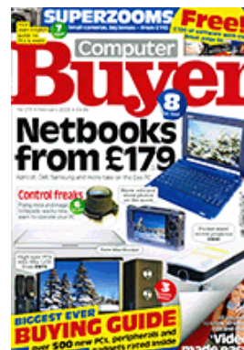
Computer Buyer, issue 213 (page 90)

Auslogics Disk Defrag is extremely simple to use, does not require any analysis phase and is faster than most of other disk defragmentation software.