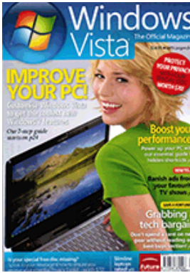
Windows Vista: The Official Magazine, issue 29 (page 20)

Auslogics Registry Defrag is useful and essential tool in keeping your registry defragmented.