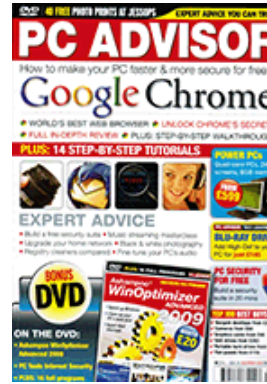
PC Advisor, issue 161 (page 105)

Auslogics Registry Defrag is useful and essential tool in keeping your registry defragmented.