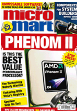
MicroMart, issue 1040 (page 90)

Are you a techno-fanatic, who needs the registry to be squeaky-clean with absolutely no stray entries...? Choose ... Auslogics Registry Defrag.