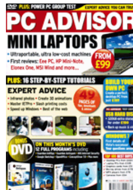
PC Advisor, issue 157 (page 58)

Auslogics BoostSpeed can protect you from identity theft. Being a computer optimization tool, it also includes useful privacy and security [tools].