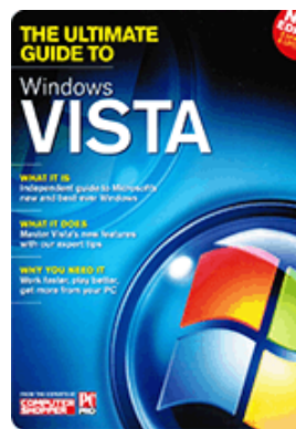
The Ultimate Guide to Windows Vista (page 73)

This application is an ideal solution for anyone who wants to boost their computer for peak performance without costly hardware upgrades.