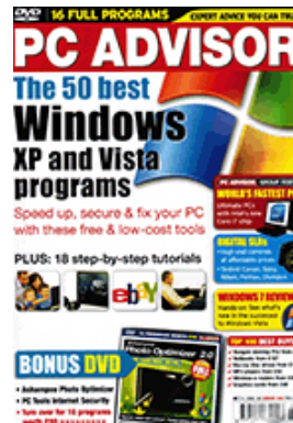
PC Advisor, issue 163 (page 92)

Auslogics Registry Defrag is an excellent tool that can analyse the registry for dead space and display it in a simple chart.