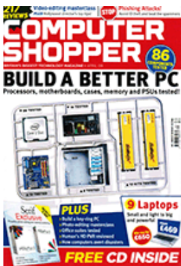
Computer Shopper, April 2009 (page 160)

If you delete a file, or a folder with Auslogics' File Shredder, you can be sure that they will be impossible to recover.