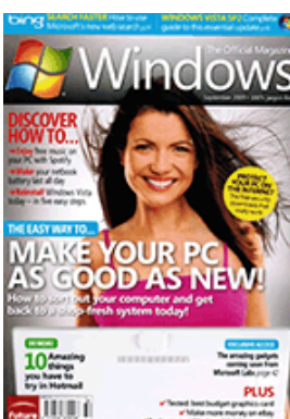
Windows: The Official Magazine, issue 32 (page 21)