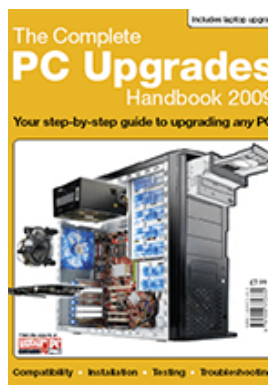
PC Upgrade Handbook (page 43)

To prevent system slowdowns from happening ... we recommend using the faster and more advanced version in Auslogics BoostSpeed.